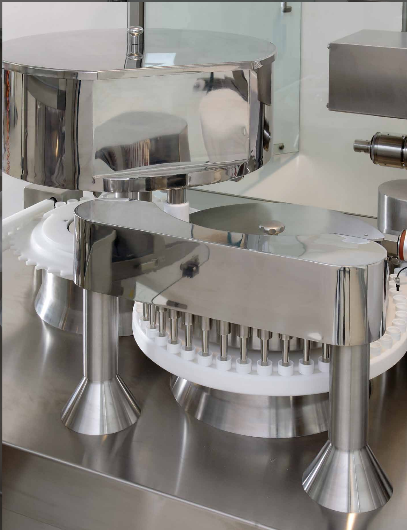
● FX/FE SERIES